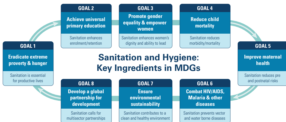
Figure 1: Sanitation and Hygiene: Key Ingredients in MDGs (modified from Mehta and Knapp, 2004)

that the transition from unimproved to improved sanitation is accompanied by more than a 30% reduction in child mortality (e.g. Esrey et al., 2001).