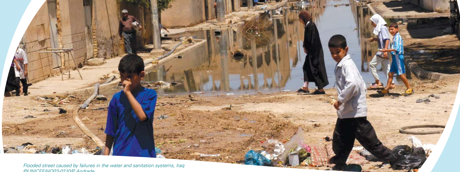
Flooded street caused by failures in the water and sanitation systems, Iraq