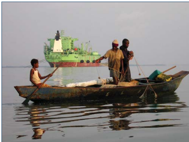
Fishing in oil polluted water, Nigeria

It is becoming increasingly apparent that large volumes of water are unaccounted for within water management structures around the world. Termed virtual water, this water is the amount used to produce items from food items to vehicles. According to the World Water Council, 1000 l of water is required to produce 1 kg of wheat. A single kilogram of beef requires 16 000 l (Waterfootprint.org). By understanding this trade in virtual water, it is possible to manage imports within an IWRM framework in order to maximise water availability for domestic purposes. Thus, if a country has water scarcity issues, it should not be trying to develop a beef export market or any other product with a large virtual water footprint. Rather, it should be exporting products with a small virtual water footprint and importing those which use significant volumes of water to produce. This will become increasingly important with the push towards biofuel production. In addition to the issues associated with food versus fuel production, there is an equally important discussion surrounding the amount of water required to produce these crops and how this affects the water budget of the region.