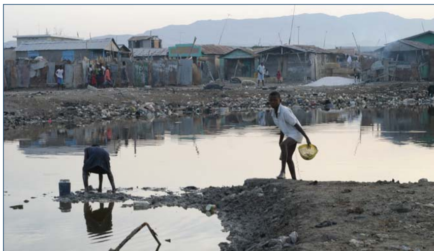
Shrimp fishing in sewage-infested flood waters, Haiti

that there is more time to tend to crops and livestock, more time and resources to spend on improved food preparation, more time to attend school and, an opportunity to participate in the local economy; all mechanisms which work towards breaking the cycle of poverty.