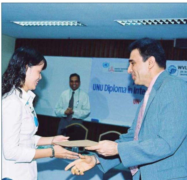
UNU-INWEH WVLC certification in IWRM

Knowledge translation, transformation, synthesis and exchange, in association with a global platform to provide products to as broad an audience as possible, can provide a basis for informed decision-making and technological advances to fill gaps. At the practical level, demonstration and pilot projects provide examples of success and application of innovations (including governance, institutional, and technological). However, knowledge transfer is a challenge for the academic community, requiring novel ways to engage various aspects of the population. To this end, new academics need to be recruited and trained to better meet the needs of the future.