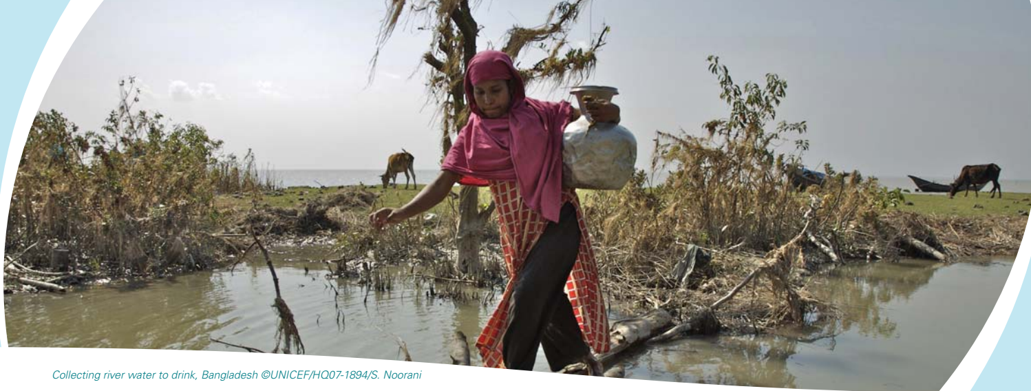
Collecting river water to drink, Bangladesh