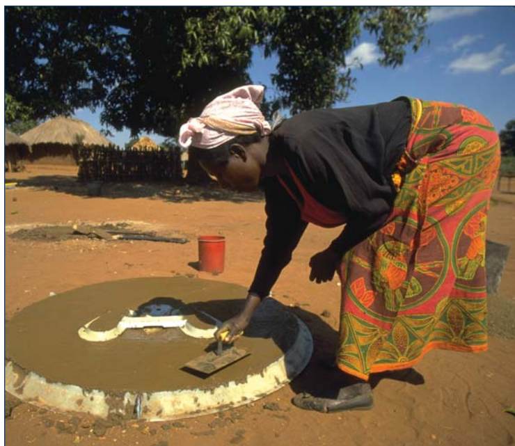
Making a cement slab for a latrine, Zambia