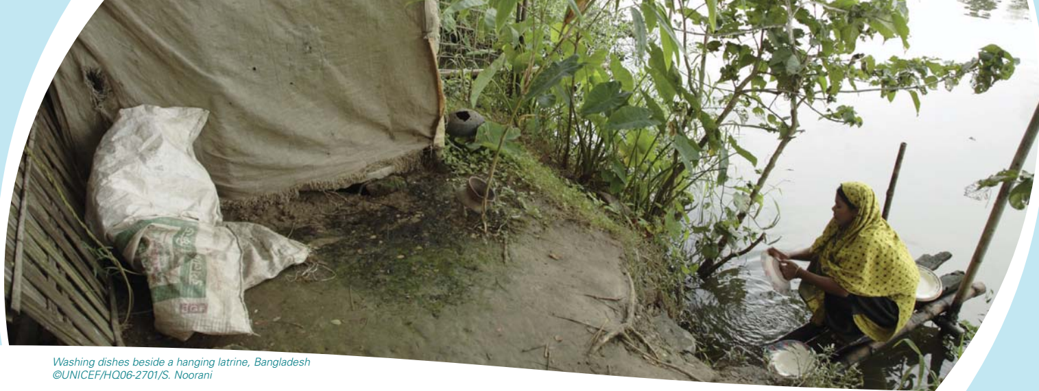
Washing dishes beside a hanging latrine, Bangladesh