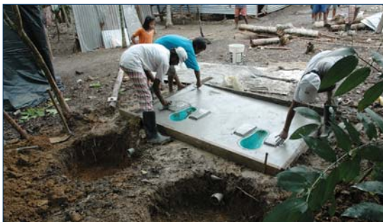
Buildign leach pit latrines, India

Methods, approaches, data requirements and minimum knowledge requirements have to be defined for both water and health professionals. Train-the-trainer programmes can be used effectively to enhance local capacity, strengthen retention and provide peer-to-peer training that is sensitive to social and cultural frameworks. Incentives