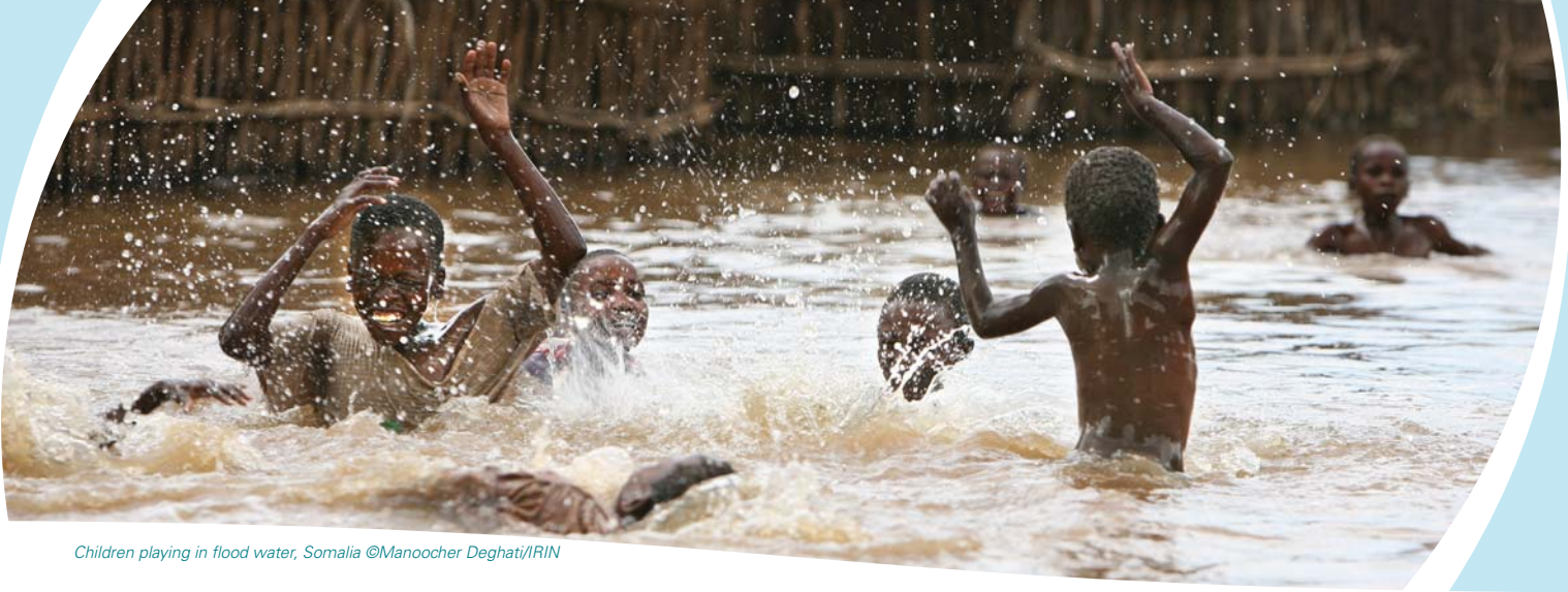
Children playing in flood water, Somalia

Key requirements to improving human health and well-being within the context of safe water include: