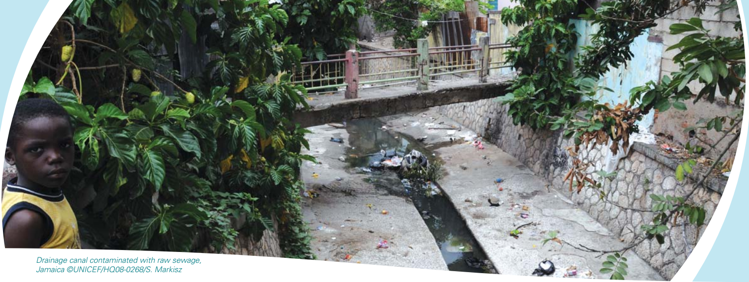
Drainage canal contaminated with raw sewage, Jamaica

Humanity has always depended on the services provided by the biosphere and its ecosystems. Water management without regard for the ecosystem unit is set up for failure from the outset, as all aspects of ecosystem health have to be addressed to maintain equilibrium within the system. Given the significant and ever-increasing demand for services, ecosystems are being changed to alter the provisioning ratios (e.g. converting forest to agricultural land). In many cases, this contributes to degradation of ecosystems, further reducing the capacity to provide the services that we depend upon. The resulting burden is disproportionately held by rural communities, especially those who are impoverished. Further, environmental/water conservation and good use by local people will depend on their objective living conditions and the capacity to meet their basic immediate material needs (e.g. if a family cannot afford to purchase fuel, they will harvest local materials for their needs). As identified by Corvalan et al. (2005), allowing the continuation of ecosystem degradation is preventing achievement of the MDGs.