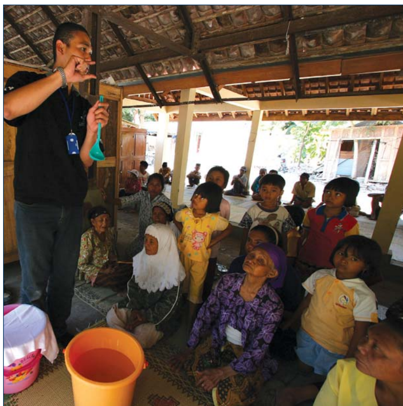
Demonstrating water treatment supplies, Indonesia

A better understanding of the functions and connections of natural and social systems has to be achieved. In order to optimize investments and the resultant benefits, a strategy is required which takes the natural distribution of water and the potential implications of climate change into account. Generally, a broader approach is required to include water-health perspectives into plans and activities to address the significant challenge of meeting the MDGs and improving the quality of life of people around the globe. Actions required to meet these goals include provision of water supply, sanitation and treatment infrastructure as well as promotion and education of proper hygiene and integrated water resource management. Policy and legal frameworks that fit within this context need to be developed at the national and international level.