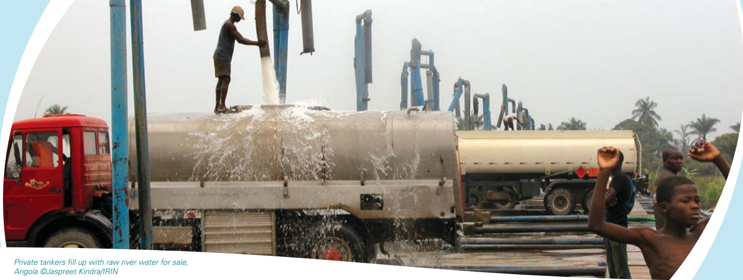
Private tankers fill up with raw river water for sale, Angola

such as opportunities for promotion, greater responsibilities or enhanced standing in the community can all be effective, not only for participation, but for retention of capacity once established. Additional capacity building and retention practices include diplomas, certification courses and curriculum credits for continuing education, which further serve to enhance dissemination of current and emerging knowledge, especially to the front-line.