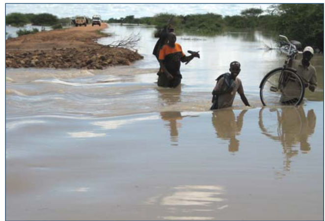
Wading through flood waters, Kenya

People can circumnavigate the globe in less than 24 hours, carrying diseases with them and exposing others even before manifestation of symptoms. Surveillance of disease has become international in scope, as evidenced by the