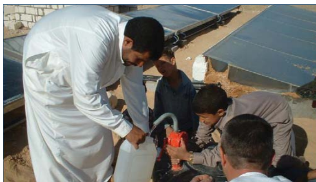
Solar desalination, Egypt: Courtesy of T. Schaff, UNESCO

Schools are cornerstones for education within the community. By emphasizing the importance of responsibility for their own health and links between residential actions and environmental effects to children, the uptake of new practices is disseminated into both the household and the community as a whole. In general, educating individuals can have the additional advantage of reducing the number of stressors that they face, resulting in improved health. Moreover, there are benefits accrued from the more rapid uptake, and enhanced health benefits, of water and sanitation solutions that are associated with increased education and awareness. There is a need to create local centres with a knowledge-based and innovative approach to training that ensures availability to and appropriateness for operators in small, remote communities and which address both long and short-term needs. In addition to training, opportunities exist to provide technology demonstrations, operation and maintenance support, education and outreach, advice for governments on research and development priorities, scholarships to Universities and partnerships with research groups.