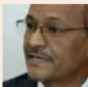
Aghatam Ag Alhassane, Minister of the Environment and Sanitation, Mali